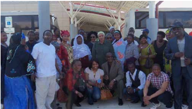
ASC Clients pose for a photo together in DC at the April 10 th Immigration Rally