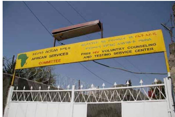
The sign above the entrance to the Shola Clinic.

During our stay we visited four out of the five clinics that we have operating in Ethiopia. Our first stop was to the first clinic ever established, the Shola Clinic in Addis Ababa.