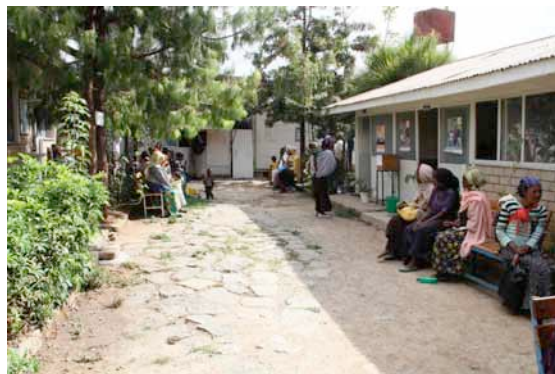
The bustling courtyard at the Shola Clinic

This clinic began as a small one-room structure placed situated in one of Addis' largest markets, Shola. In the ten years since it's establishment it has grown to over 4 buildings and serves a client base of over 10,000 each year.