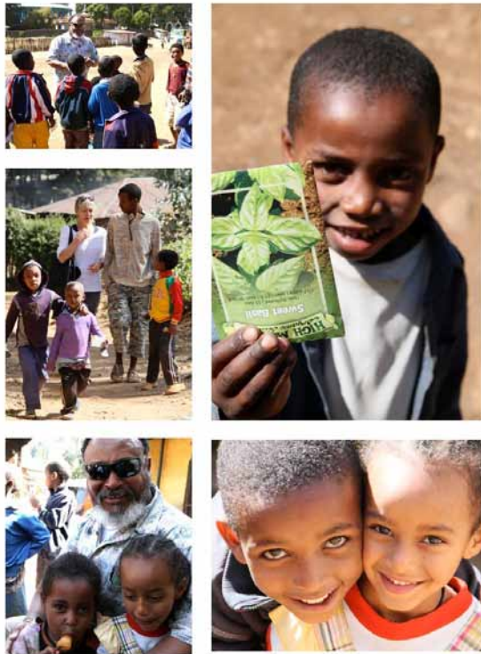
A Collage of images from the Entoto Mountain visit.

As you might recall, in December we put a call out to you, our supporters, to assist us in filling a funding gap for our Ethiopia operations, and you came to our aid. We raised significant funds, enabling ASC Ethiopia clinics to remain open and operational. I only wish that every person who reads this would have the opportunity to travel to Ethiopia and see first-hand the work that is being done on the ground, and the dedication of the staff as they serve some of the most under-served populations in the country. I only hope that my documentation and these photos will be enough to at least partially convey the beauty of the country, its people and the work that African Services is doing there.