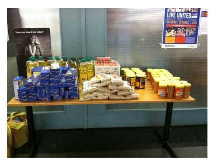
Pasta, Oil, Beans, Coffee & Peanut Butter...ready to be bagged!

While $800 can buy plenty of food in the city, Sicomac was able to contribute a small mountain, thanks to one of the volunteer's shopping expertise and some friendlier New Jersey prices. "They asked me at the grocery store if I was from Extreme Couponing," she joked, referring to the TLC show in which expert shoppers manage to leave the supermarket with cartfuls of food for a few nickels and pennies. The haul included beans, rice, oil, peanut butter, coffee, canned fruit and vegetables, cereal, pasta, soup and more.