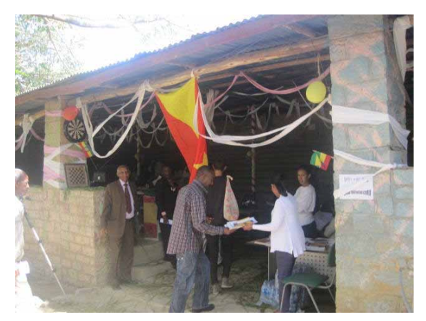
The ASC Mekele Clinic Auditorium is decorated for the 5th Anniversary Celebration

ASC Mekele's programs are thriving as well. We attended the 5th anniversary celebration of the Mekele clinic, in the open-air amphitheatre at the clinic.