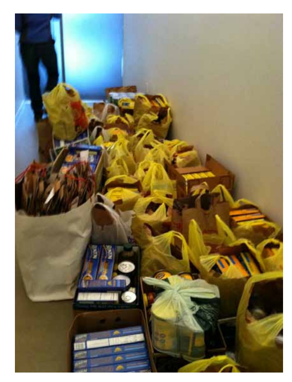
All of these bags fit in one car?!

African Services recently welcomed members of the Sicomac PTO, who arrived with a van full of groceries to donate to the ASC food pantry. Volunteers helped us unload the bounty and bring it upstairs to the pantry, after driving into New York City from their homes in Wyckoff, New Jersey.