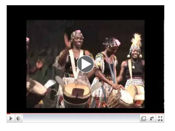
NIMBAYA! Video Performance