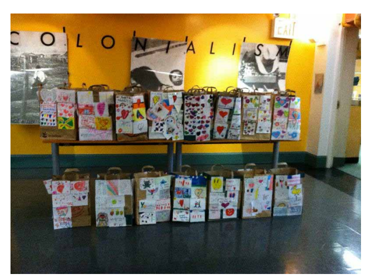
Decorated bags...ready to be filled!

While $800 can buy plenty of food in the city, Sicomac was able to contribute a small mountain, thanks to one of the volunteer's shopping expertise and some friendlier New Jersey prices. "They asked me at the grocery store if I was from Extreme Couponing," she joked, referring to the TLC show in which expert shoppers manage to leave the supermarket with cartfuls of food for a few nickels and pennies. The haul included beans, rice, oil, peanut butter, coffee, canned fruit and vegetables, cereal, pasta, soup and more.