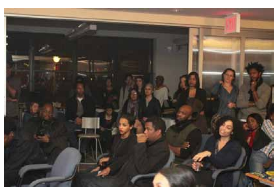
A packed house for the premiere of Harlem Nights