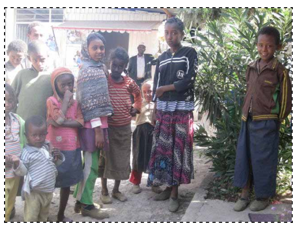
Children wait to have their shoes inspected by a TOMS Shoes representative at the ASC Shola Clinic.

children bring back their old pair in exchange for a new pair.